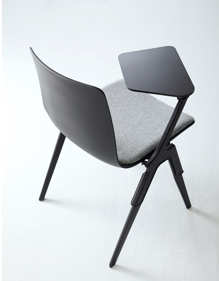
BRUNNER | A-CHAIR