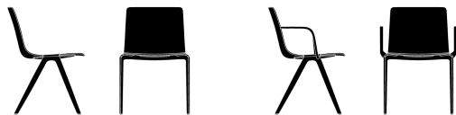
PLASTIC SHELL/ALUMINIUM FRAME