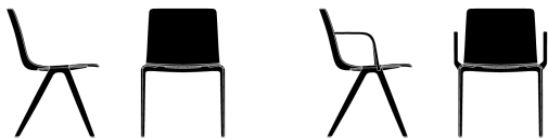
WOODEN SHELL/ALUMINIUM FRAME