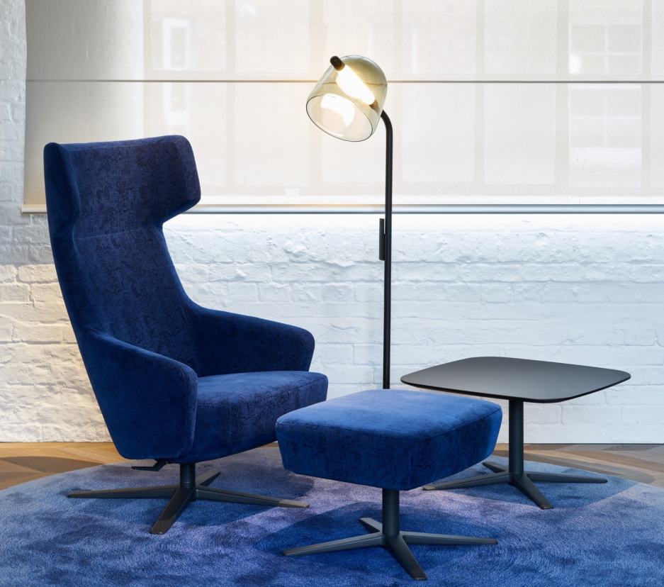
BRUNNER | ARTEMO