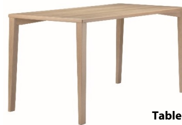
Table legs tapered on one side: Highlighting the simple, subtle design.

Four-legged tables with a linear design are the perfect addition to the range. Choose between different profiles with straight and tapered table legs. The table top and legs are connected by means of recessed mounting plates or bevelled frames.