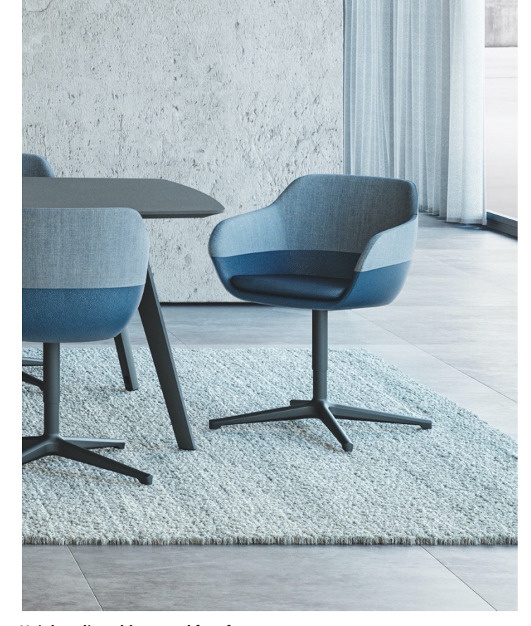
Height-adjustable central foot frame: as a four-legged frame on gliders or five-star frame on casters.

The choice of various frame types that slip underneath the seat shell, either chromed or coated, as desired, provides considerable design freedom.