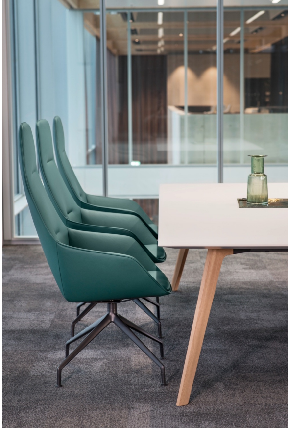
BRUNNER | RAY TABLE