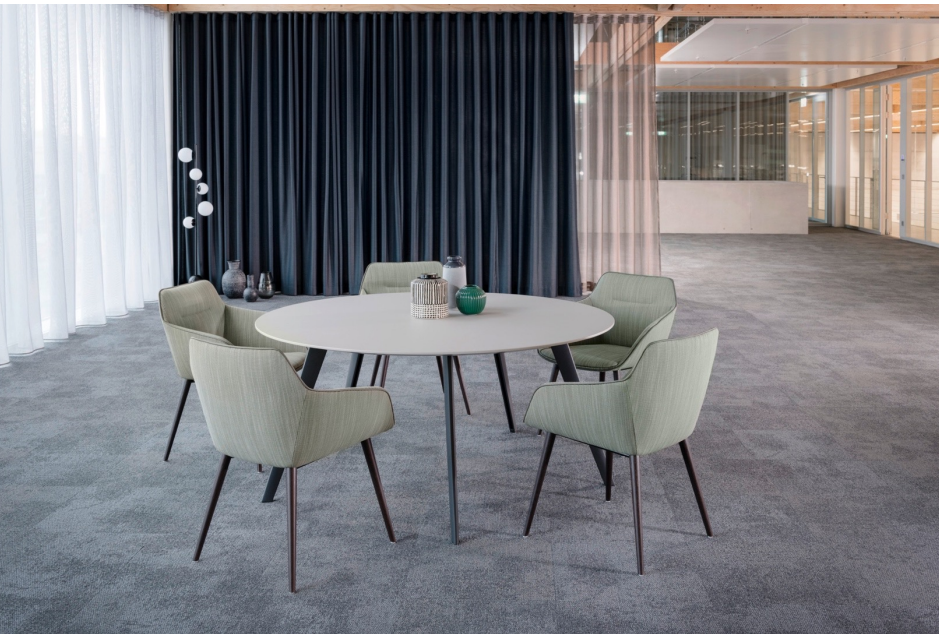
BRUNNER | RAY TABLE