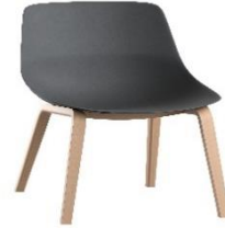
crona light lounge