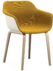
crona light touch