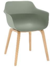
crona light eco