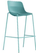
crona light bar